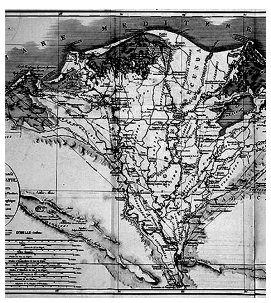
Fig. 1. Map of the Nile Delta, with the Natron Lakes at the left